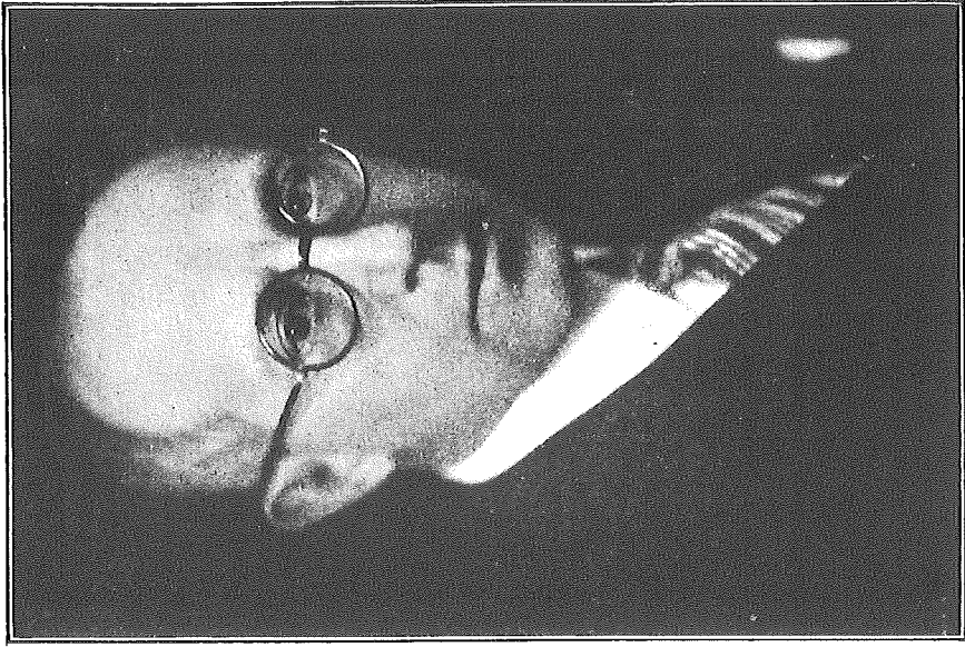
WHO'S WHO IN AMERICAN JEWRY